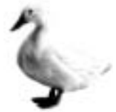
white feathers flat beak Duck