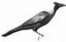
black feather sharp beak Crow