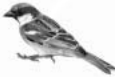
grey feather small beak Sparrow