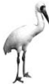
white feathers long legs Crane