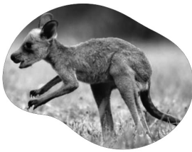
A joey grows into a