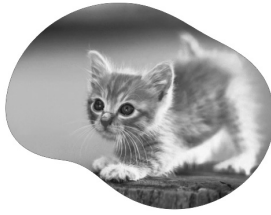
A kitten grows into a