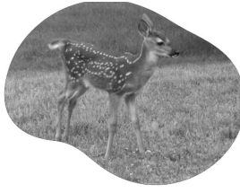
A fawn grows into a