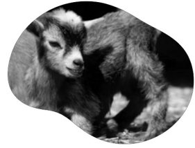
A kid grows into a