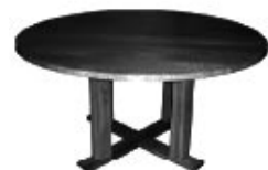
table / fan