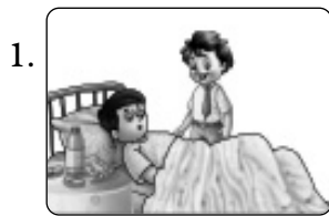
When someone is ill