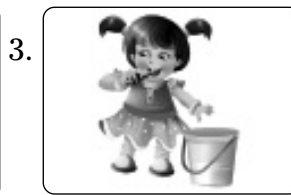
After waking up