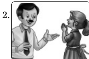
When somebody comes to meet you