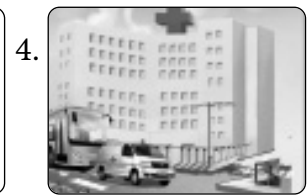
When you are in hospital

..... Help Box : Keep silence, brush my teeth, greet the person, wish him good health.