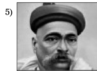
Bal Gangadhar Tilak