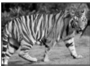
Bandipur National Park