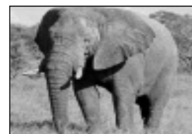
Kanha National Park